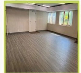
Leisure Center Activity Room